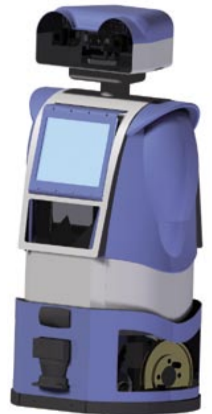
...TO THIS (an artist's impression of the robot once the shell is manufactured)